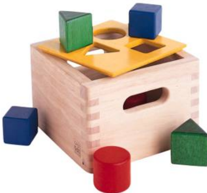
Figure 2.2: Box and blocks analogy from childhood memory: the holes on one end correspond to input templates, the holes on the other end correspond to output templates. Imagine blocks going in through one and out through the other. The blocks themselves correspond to input or output files with attached metadata . Profiles describe how one or more input blocks are transformed into output blocks, which may differ in type and number. Granted, I am stretching the analogy here; your childhood toy did not have this magic feature of course!