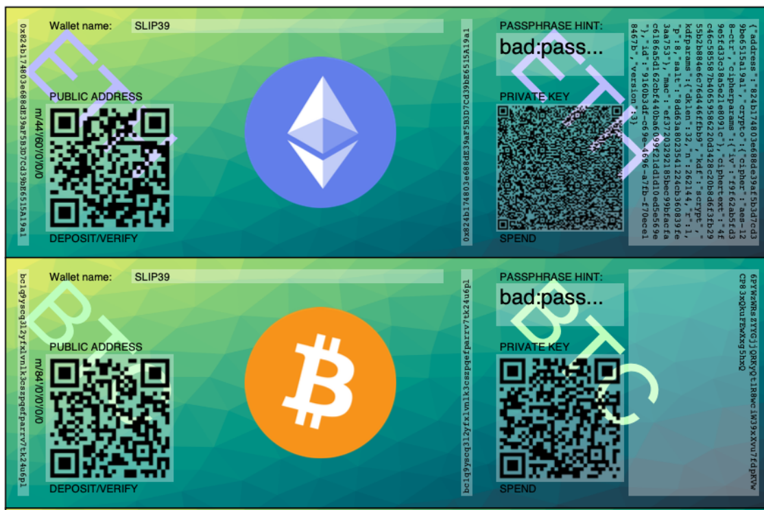
Figure 2: Paper Wallets (from --secret ffff... )