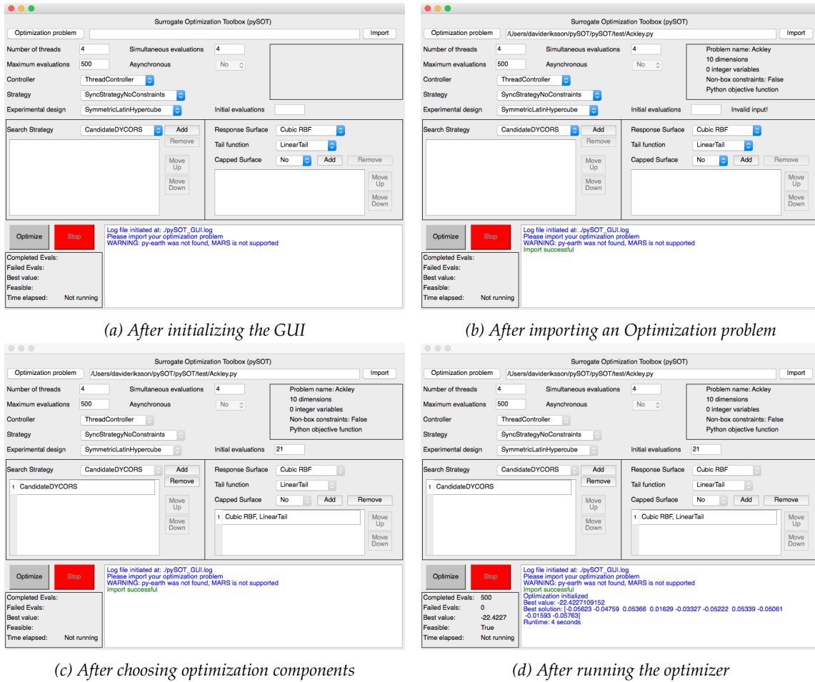
Figure 1: Illustration of the GUI

Note that both the file name and the class names are the same.