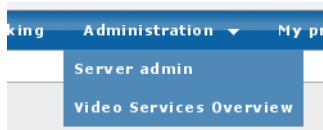
Figure 2. Administration menu

Or, a Video Services Overview menu entry in your Administration menu (if you are also an Indico administrator):