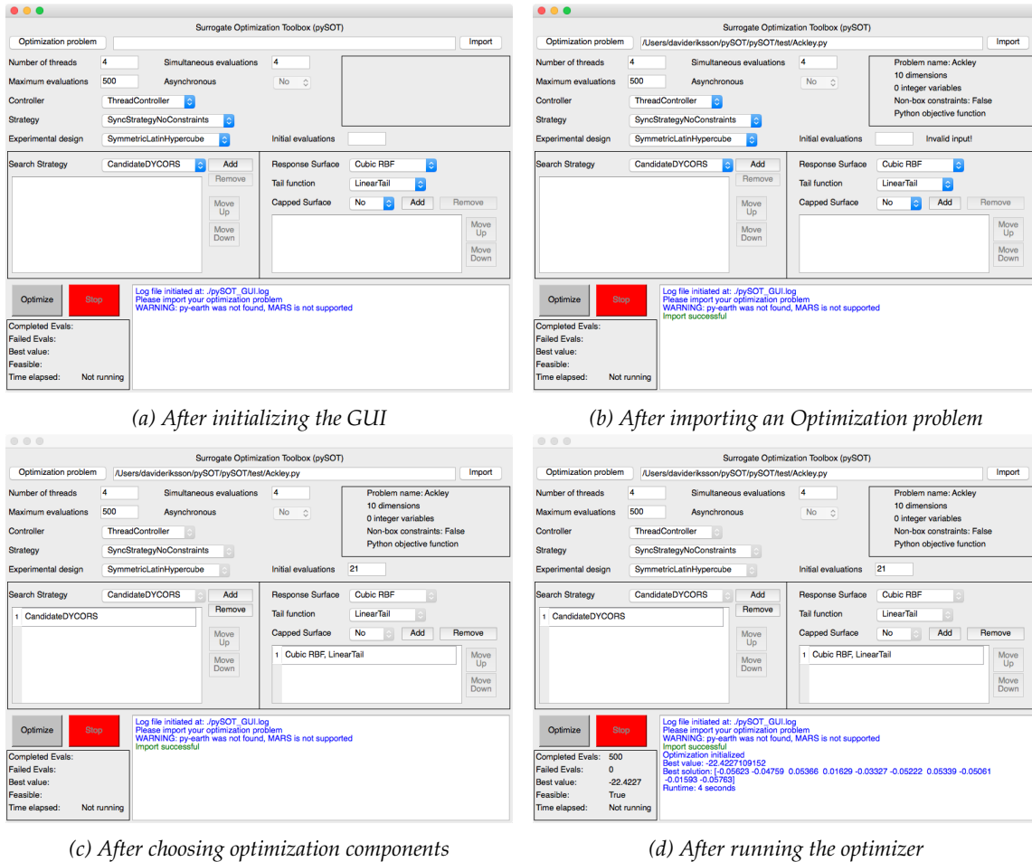
Figure 1: Illustration of the GUI

Note that both the file name and the class names are the same.