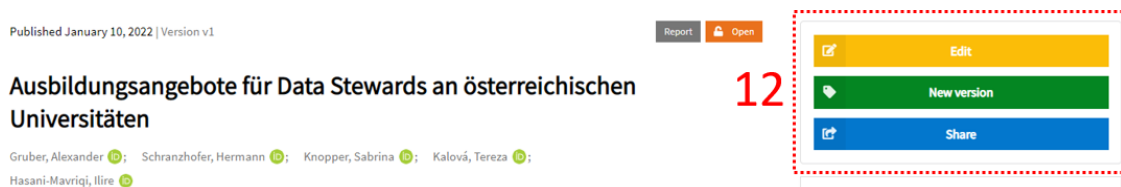
Figure 6: Entry View mode

A few words about the data you want to upload: Please upload only data or metadata that have been previously curated (by you or someone you trust). Long-term storage of data/metadata in public repositories should be used for data that deserves to be stored i.e. data that can enable researchers (those who obtained the data in the first place or others) to reuse them in the future. Examples of data documentation are: laboratory notebooks, questionnaires, codebooks, project reports, etc.